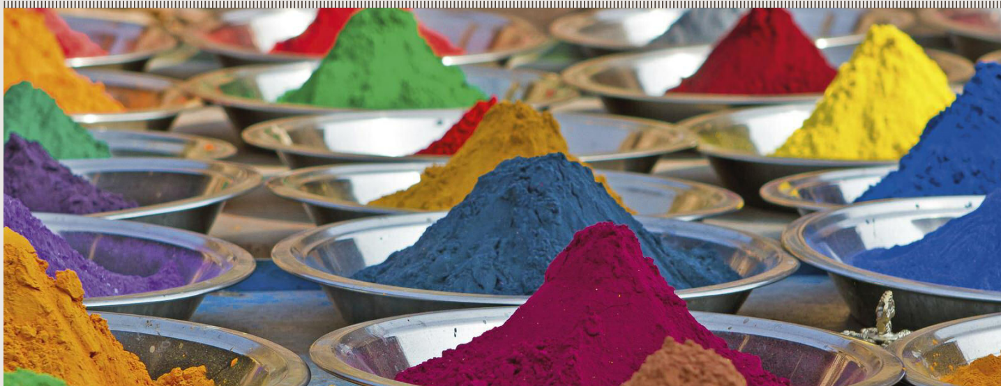
Pigments and fillers add colour to our lives.

Pigments and fillers make our everyday lives more colourful